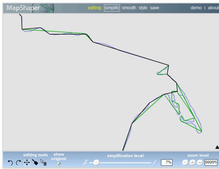
Figure 3: A comparison of DP simplification (green), modified VW simplification (black) and the original linework (blue). Note that at this level of simplification, modified VW has filtered out the narrow spits of land, while DP has created spikes and a self-intersection. Modified VW has retained more of the undulating detail in the upper left section of the screen.

The third simplification method in MapShaper's current repertoire is a modified version of VW that is intended to create linework with an even less jagged appearance. As described above, classic VW uses triangle area to quantify deviation. VW can easily be modified to use a combination of area and other properties of triangles, such as “flatness,” “skewness,” and “convexity” (Zhou and Jones 2004). We used an error metric that weights the area of triangles using the angle formed by the two line segments that are adjacent to each polyline vertex. Given two triangles of equal area, the triangle with a more acute angle will be removed first. Our modified area metric results in polylines that are smoother than those produced by standard VW.